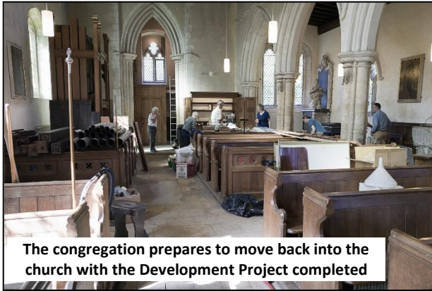
The congregation prepares to move back into the church with the Development Project completed

We are proud and grateful to have raised over £300,000 for the current redevelopment project. Although a proportion of this money has come from grant giving bodies, much has been contributed by the local community – a testament to the affection in which this village institution is held. Our Parish Council Chairman said “Madingley is a small village with very limited facilities. The church is at the heart