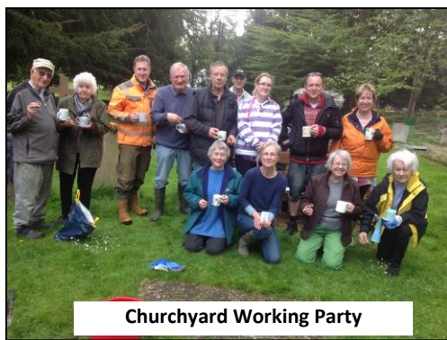
Churchyard Working Party

Our regular routine is to have one service every Sunday, with Morning Prayer on the first Sunday of the month followed by three services of Holy Communion. In response to the recent congregational questionnaire the PCC will be discussing how to alter this routine, given the permission of the Bishop. We have a Parish Prayer Group who meet regularly at the home of our Lay Minister and have offered Lent Talks, Carol, Remembrance and other special services to the community.