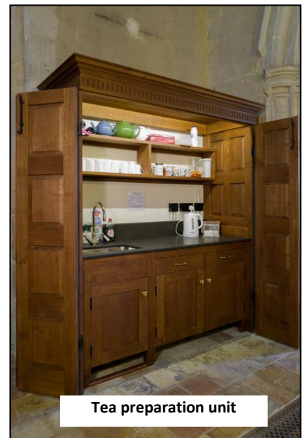
Tea preparation unit

With 61 names on our updated electoral roll, the average weekly congregation is 20 people, half of whom live in the village with the others joining us from local areas such as Hardwick, Bar Hill, Girton and Madingley Road. The congregation always doubles in size at Christmas and Easter services when Christian families in the village, who are regular members of other churches in Cambridge, join us for worship.