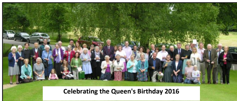
Celebrating the Queen's Birthday 2016